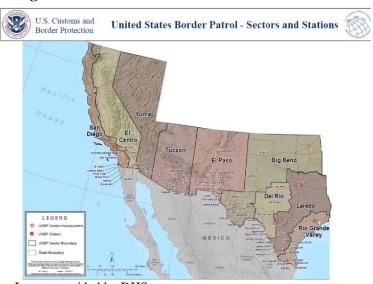
Figure 1: Nine Sectors of the U.S.-Mexico Border

Each of the nine sectors of the U.S.-Mexico border has unique terrain and faces endemic challenges. <sup>81</sup> For example, the RGV sector border is in the middle of the Rio Grande, a narrow, often shallow, and easily navigable river. Smugglers cross the Rio Grande by foot, raft, or, in some locations, vehicles. <sup>82</sup> This makes enforcement and security quite daunting. In Arizona, two mountain ranges provide concealment for smugglers and illegal crossers. Additionally, protected lands, including national forests, wildlife refuges, military training ranges, and a Native American Reservation, restrict access to approximately 80 percent of the border in the Tucson and Yuma sectors. <sup>83</sup>