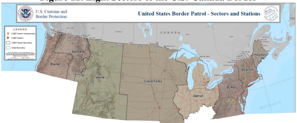
Figure 11: Eight Sectors of the U.S.-Canada Border